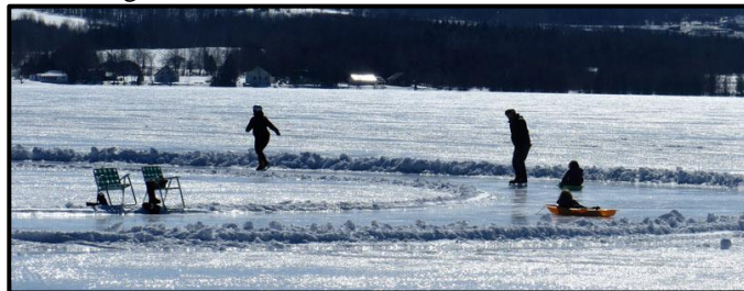
Our skating rink, unknown