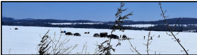
Ice Fishing, unknown