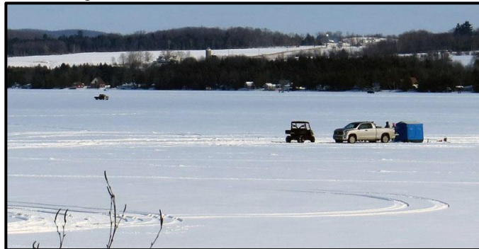
A wonderful day fishing, unknown